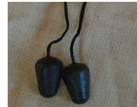
Horse Ear Plugs.

As a competitive athlete, your horse needs to be in top condition, and if there is discomfort it can cause your horse to quit working for you. Performance is everything. And good horsemanship starts with knowing what condition your horse is in, and how to help them maintain their top athletic ability. In the sport of mounted shooting, your horse is your teammate, but you are the captain. It's your job to do the right thing for your team, and using the right equipment in the right way will only help.